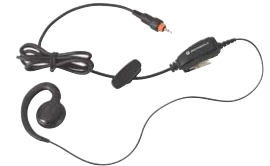
Earpiece with inline PTT button

This revolutionary, clean design provides rapid charging of your Motorola CLP. A Multi-unit charger allows you to conveniently charge up to six Motorola CLPs simultaneously. The charger is designed with a back pocket to store your earpiece while the unit is charging, and can be mounted on the wall if space is at a premium.