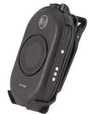
Swivel Belt Holster