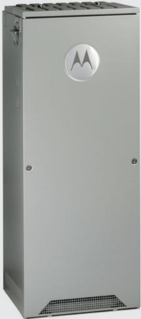
DIMETRA EXPRESS MTS4 TETRA SYSTEM