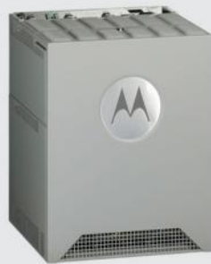
DIMETRA EXPRESS MTS2 TETRA SYSTEM